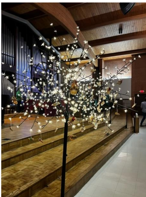
Debbie's Tree with the beautiful keepsake angel ornaments.