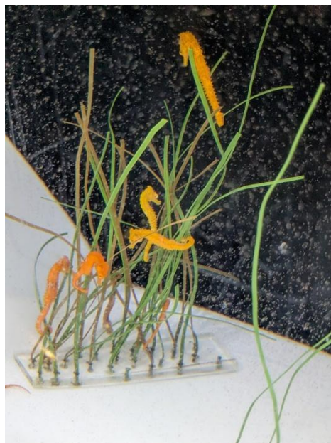
(Photo: March 2026 Regional Conference in Hawaii. Aquarium in Waikiki)